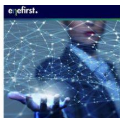
Report on barriers to implementing E1st in the EU-28

The H2020-funded project enefirst releases a new publication , authored by BPIE and co-authored by IEECP and RAP: it focuses on barriers to implementing efficiency first in the EU in several policy areas linked to energy use in the buildings sector (such as network codes, renewable energy policy, building regulations and others). The report builds the analysis from a literature review and results from a survey. The barriers are legal, regulatory, institutional, organizational, economic and more, and the top persisting barriers identified are political will and cultural differences. A majority of respondents point as barrier the lack of expertise, knowledge, awareness or understanding: a proactive dissemination of good practices, case studies and the multiple benefits of E1st is important. The report was also highlighted on the CORDIS website.